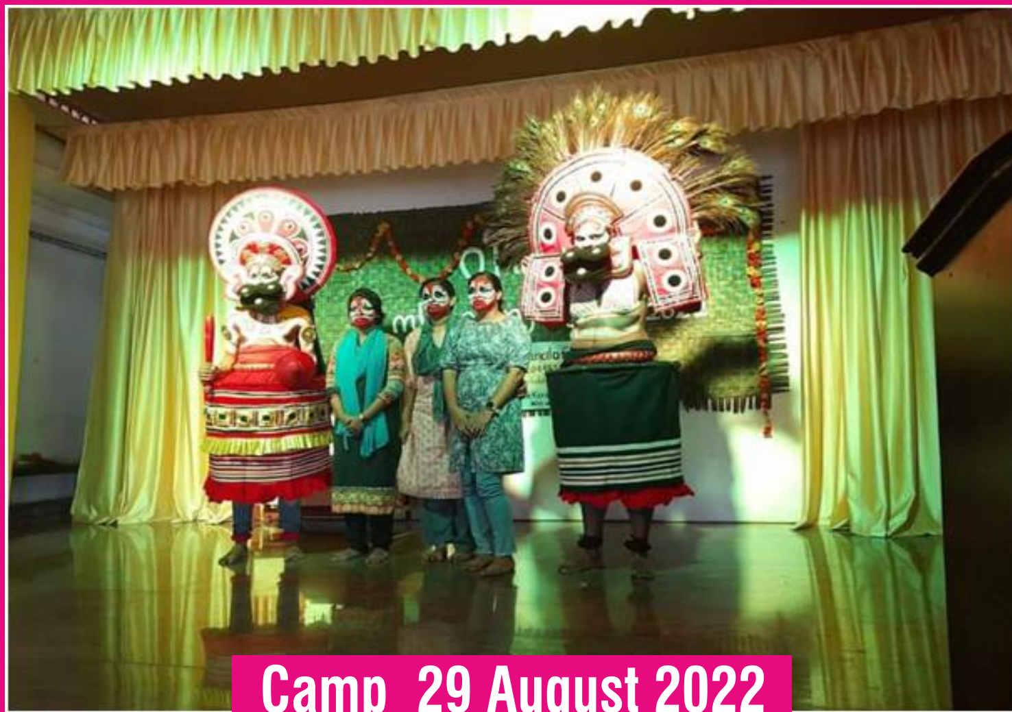
Camp 29 August 2022