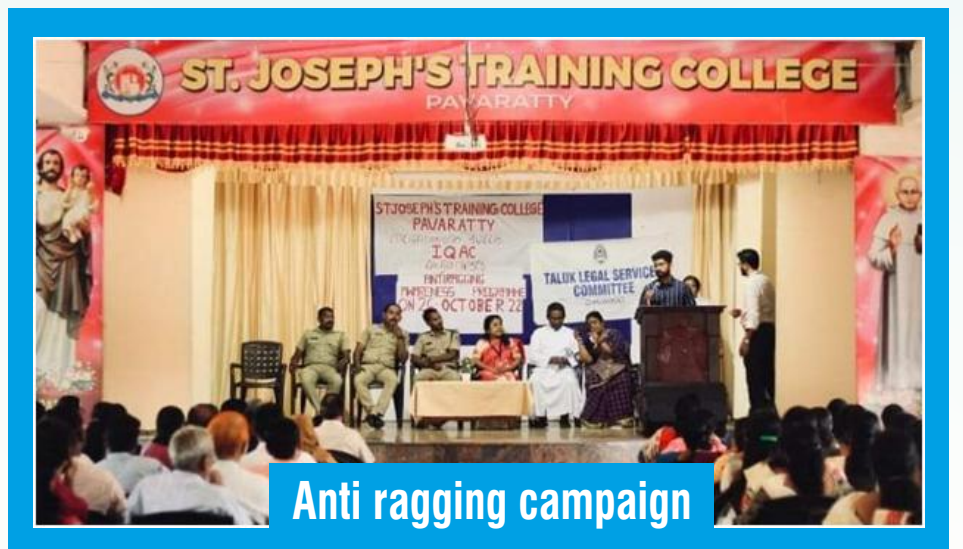
Anti ragging campaign

These events underscore the students' dedication to raising awareness about the dangers of drug abuse and their proactive role in community health initiatives.