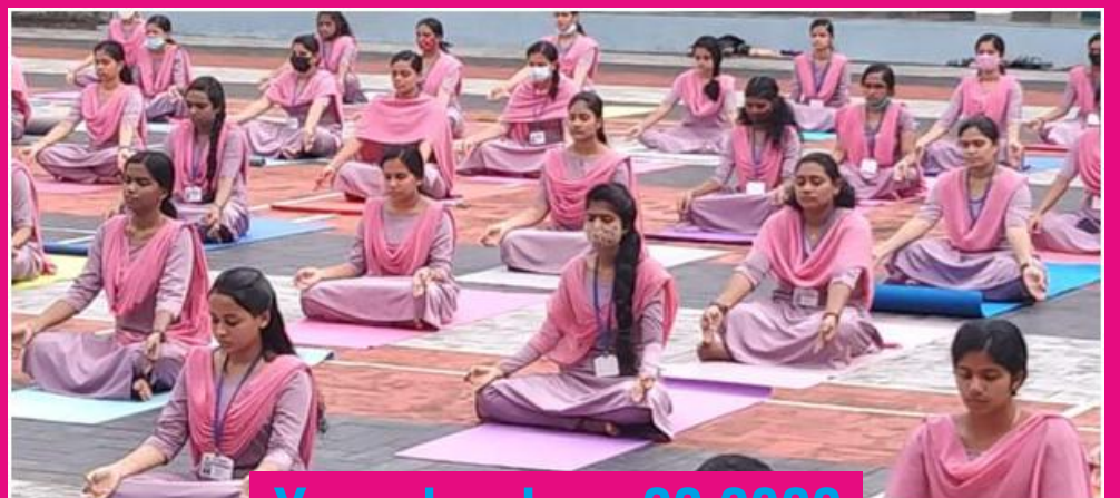
Yoga day June 22 2022