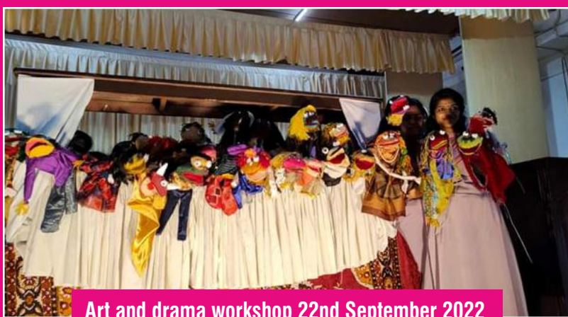
Art and drama workshop 22nd September 2022