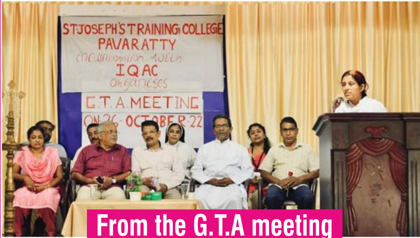
From the G.T.A meeting