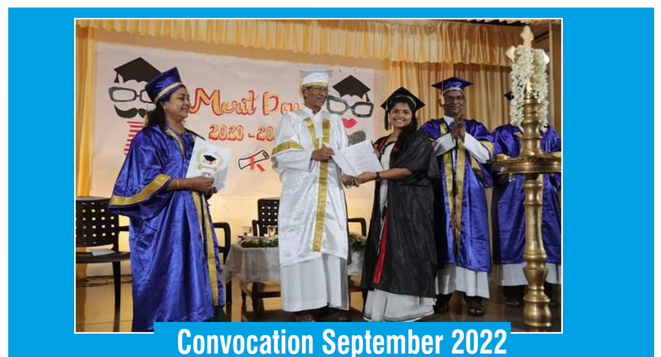
Convocation September 2022